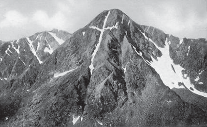
Mount of the Holy Cross, State of Colorado, U.S.A.

The Bible speaks about two mountains that were important in the life of the prophet Elijah, both literally and spiritually—Mount Carmel and Mount Horeb, also called Mount Sinai. Mount Carmel was the place where Elijah invited the Israelites to choose between the pagan gods or the true God, Jehovah, as their leader. On Mount Horeb (Sinai), nearly 600 years after God, amid thundering, proclaimed the ten commandments, Elijah heard Him speak in a “still small voice,” calling him to complete his mission as God’s messenger (see 1 Kings 19:12).